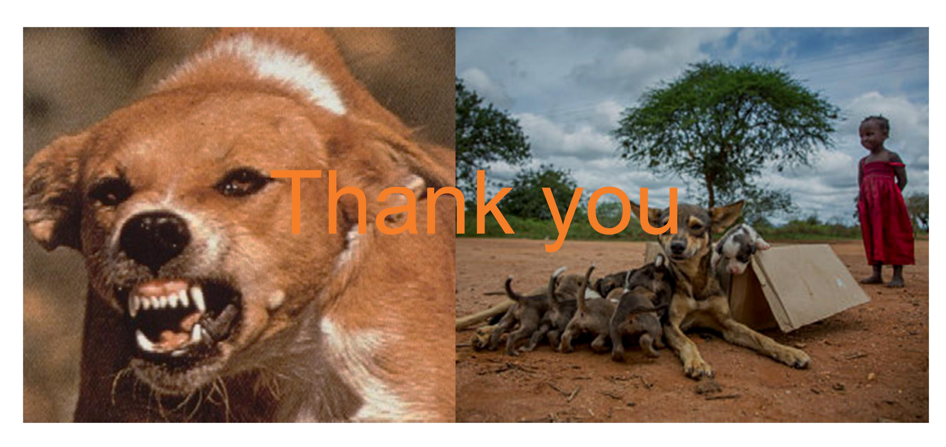
Dog Population Management and Rabies Control