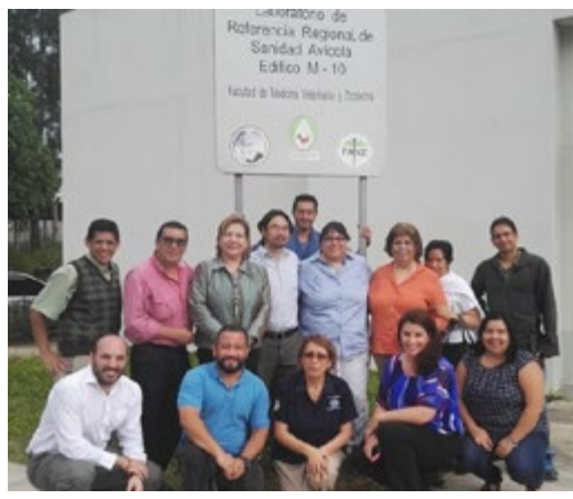
The collaborative team at the SARE workshop outside the central reference laboratory.

One of the more prominent outcomes of the SARE was the creation of the National Rabies Working Group for Guatemala. The group now has monthly meetings to provide technical and scientific support to