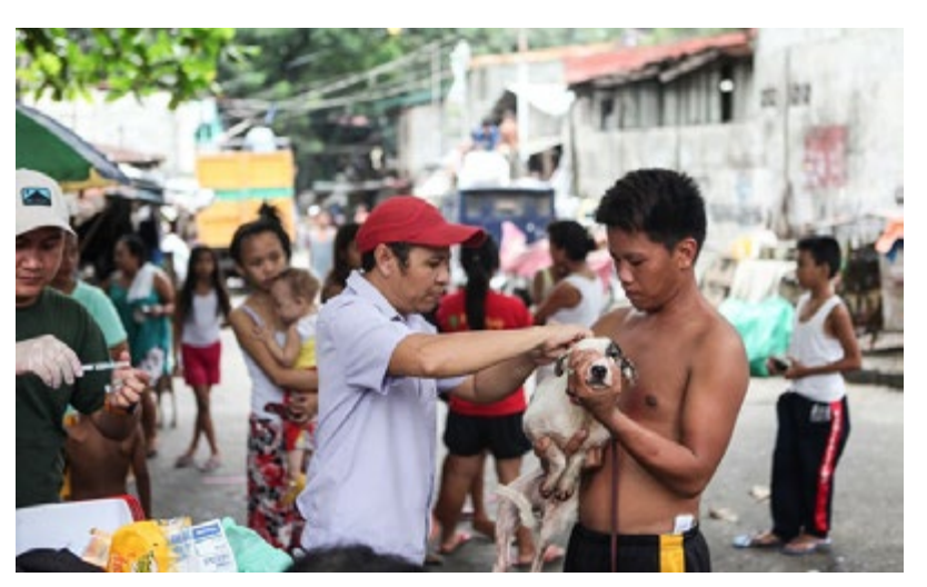
Dog vaccination station in The Philippines, 2016.

In this study, the authors evaluated three canine rabies vaccination demonstration sites that were coordinated by the World Health Organization and supported by the Bill and Melinda Gates Foundation, primarily during the years 2010-2012. These sites were enzootic for rabies and included: 1) KwaZulu-Natal, South Africa (primarily semi-rural) 2) South-Eastern Tanzania (primarily rural), and 3) Cebu, an urban area in The Philippines, a program which also included a rural site. The programs exhibited a wide variation in how well-established their programs were, the level of government investment in rabies control campaigns, and in the population density of the area.