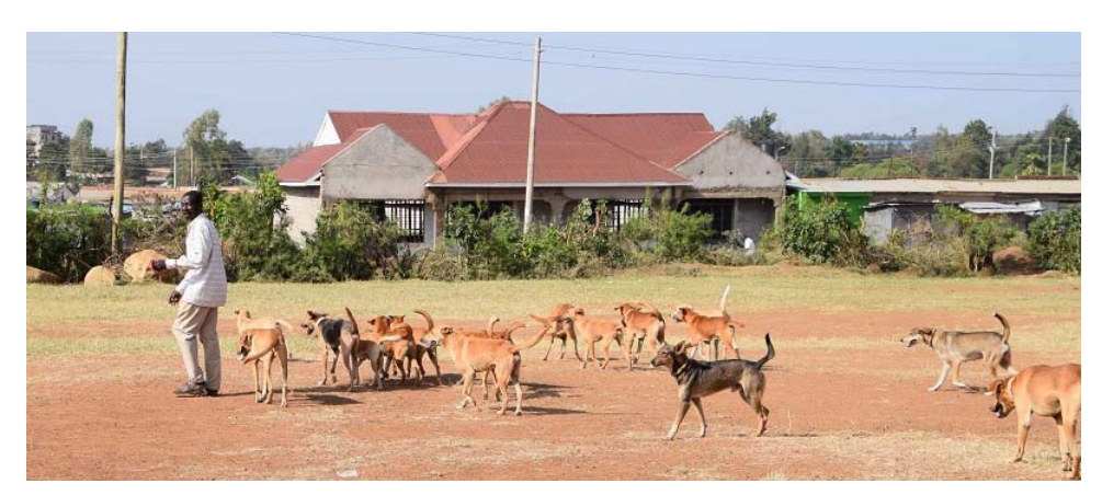
A man in Siaya who brought his 48 dogs for rabies vaccination

Last year, World Animal Protection partnered with Makueni County Government to start implementation of two of the main pillars of the rabies elimination strategy for Kenya: 1) mass dog vaccination reaching 70% of the dog population and 2) rabies awareness campaigns in schools. In response, the Makueni government matches dollar for dollar funding from World Animal Protection and in addition has committed its own funds to provide free post-exposure