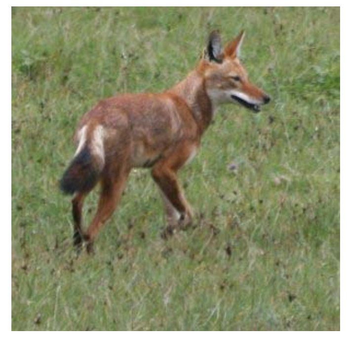
Ethiopian wolf by Gert Vankrunkelsven (Own work) via Wikimedia Commons

During the vaccine trials, 21 wolves were trapped after consuming the bait vaccinations, with fourteen of these testing positive for the vaccine's biomarker. Additionally, the levels of antibody in 12 of the 14 positives were high enough to proved protective immunity, and 7 of the positives had titres above 0.5 IU/mL. All of the vaccinated wolves, except one, were still alive 14 months after trapping and testing.