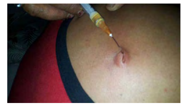
A scratch by an animal is raised after RIG is injected locally

Whilst the use of rabies vaccine is high, the use of RIGs is very low amongst bite patients. At the Shimla anti-rabies clinic at DDU hospital, 1,834 people presented with animal bites in 2013, including 1,168 dog bites and 580 monkey bites. All of these received vaccine, but even after counseling over its importance, only 4 patients opted to receive RIG, because of the expense of the product (a cost of around 1200 Rupees (around $20) for equine RIGs or 30,000 Rupees (around $500) for human RIGs for an average patient). The vaccine is now given free as a result of the shift to low cost intra-dermal vaccination, but RIGs have to be purchased