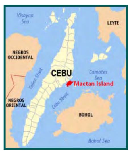
Map of Cebu, Philippines highlighting the location of Mactan Island. From Image created and copyright (2004) by seav. Released under the GNU FDL.

The Global Alliance for Rabies Control (GARC) has teamed up with the provincial government of Cebu (Philippines) led by the Provincial Veterinary Office (PVO) and the Provincial Information Office (PIO) to conduct a Media Advocacy Workshop on Rabies Awareness and Prevention. The workshop, which will take place on 22 April 2014 at the Provincial Capitol Social Hall, Cebu City, is aims to strengthen the provincial rabies prevention and elimination program.