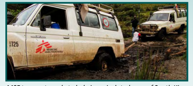
{\it MSF}\ teams\ struggle\ to\ help\ in\ an\ isolated\ area\ of\ South\ {\it Kivu}

After decades of conflict and instability in the Democratic Republic of Congo, measures to control canine rabies have not been MS implemented, and data on the size of the problem is simply not available.