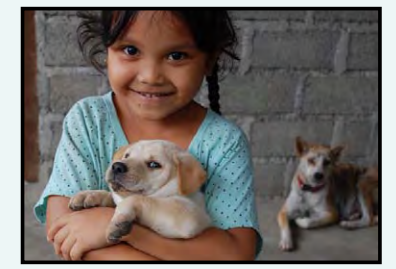
A Balinese girl holds her puppy, and a vaccinated and collared dog sits behind.

In 2009 the Australian government donated longer lasting vaccines and a local NGO, the Bali Animal Welfare Association (BAWA) with the support of the World Society for the Protection of Animals (WSPA) stepped up to implement mass vaccination campaigns. Better dog catching techniques allowed them to reach the necessary 70% vaccination coverage almost everywhere they vaccinated.