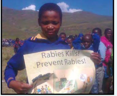
A boy holds a WRD rabies awareness poster in rural Lesotho

GARC had received some funding to help people in African countries print posters for their WRD campaign. It was not very much funding initially, but we knew there was a chance we could attract more in years to come. It had not