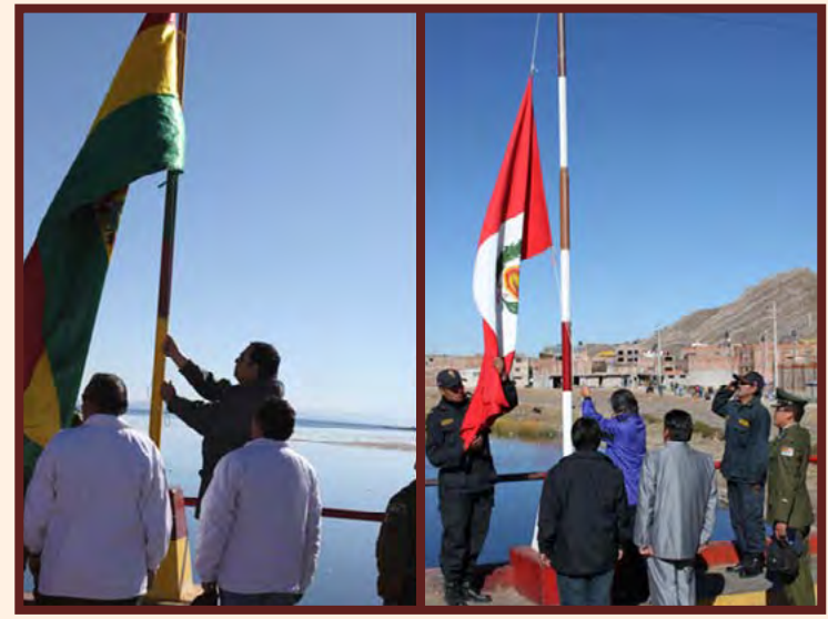
their shared border.

As the number of cases fall, the reduction to cases to zero becomes the challenge. The majority of cases now are in Bolivia and Haiti, and 16 hotspots of canine rabies National authorites from Bolivia and Peru at a vaccination campaign along transmission have been identified so that efforts can be