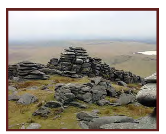
Bodmin Moor, Cornwall, UK.

On World Rabies Day 2012 (September 28th), the group will set out from Boscastle on the north Cornwall coast and embark on the Smugglers Way walk, crossing Bodmin Moor, and finishing in Looe on