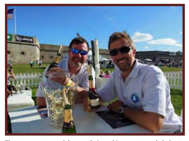
The teammates celebrate their achievement and help to counteract the weird feeling of being on dry land

In the harder moments they dodged lightning storms, were