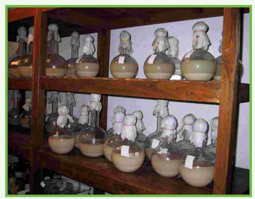
Sheep brain vaccine production chain

Nerve-tissue vaccine has also been produced for dog immunization and post-exposure vaccination of food and companion animals in