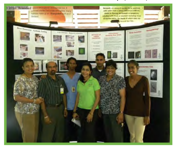
Staff of the Veterinary Diagnostic Laboratory at the inaugural WRD Event in 2010 at the Caroni Swamp Visitor Centre

In 2010, World Rabies Day (WRD) was commemorated for the first time in Trinidad with a WRD Exhibition. This