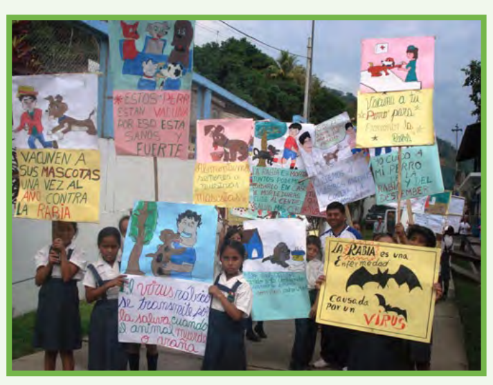
Children proudly display their rabies prevention posters during WRD 2011 events in Ayacucho, Peru.

Around the world 860 individual events were reported from 115 countries helping to educate more than 32.7 million people. This was accomplished primarily through mass media including television broadcasts, radio shows