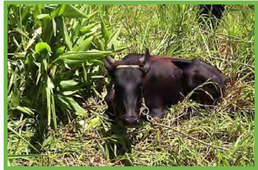
Bovine displaying signs of paralytic rabies, subsequently confirmed by DFA testing.

During the first recognized outbreak, a prophylactic animal vaccination strategy was adopted, that focused on the local bovine population. Currently, the government veterinary services routinely execute an annual vaccination program in which all healthy cattle, bison and donkeys of a minimum age are immunized against rabies by primary inoculation and routine boosters with an inactivated virus formulation. It is presently legislated, under the Paralytic Rabies Regulations (1956) of Trinidad and Tobago that during the annual program, unvaccinated animals and animals due for booster vaccinations must be presented to the inspector for vaccination. Failure to do so is considered an offense and the farmer is liable to a penalty fee.