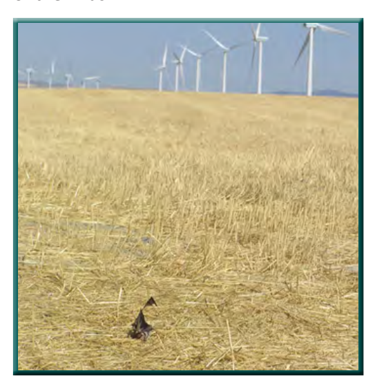
A hoary bat carcass found by wind turbines.

Given the nocturnal and elusive nature of many bats, especially migratory or tree roosting ones, human contact with healthy bats is a rare phenomenon, and studying rabies epidemiology in these hosts is difficult. Rabies prevalence estimates have been highly variable among species and across years within species. The authors set out to test whether some of this variation could be due to fluctuations in the frequency of human contact with infected individuals, rather than the prevalence of the virus.