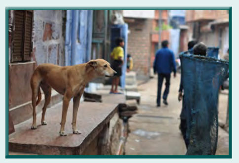
Stray Dog in Jodhpur India.

Experts on dog population management have urged the creation of a technical forum to tackle knowledge gaps and create more informed policy on the world's canine population. Delegates proposed the creation of the technical forum at a recent meeting on dog population management in Banna, Italy, jointly hosted by the World Society for the Protection of Animals (WSPA), the United Nations Food and Agricultural Organization (FAO) and the Italian organisation, the Istituto G. Caporale