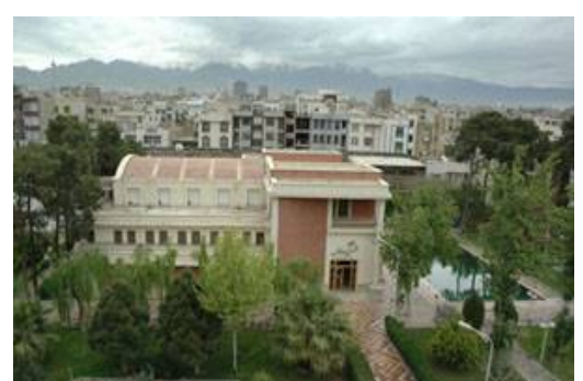
The Pasteur Institute of Iran.

The following pages give a flavour of the many events that are being planned around the world to mark World Rabies Day. For more details on each, contact details of the organisers and for other events occurring please see the World Rabies Day website: www.worldrabiesday.org