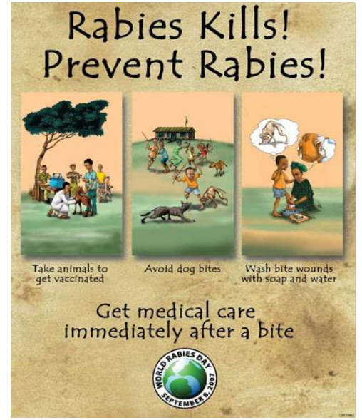
A Poster prepared by CDC for use in Burkina Faso, Ivory Coast, Nigeria, and Senegal.