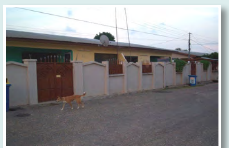
A stray dog being attracted to waste bins outside houses.

Rabies was laboratory-confirmed in one dog and a second dog was epidemiologically linked to the index. The index had been bitten by a stray dog a month earlier, and a group of stray dogs were observed living in bush next to the community and entering the community to scavenge for food in waste bins placed outside the houses.