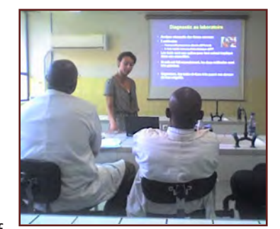
Laboratory Training at INRB

To confront this problem and strengthen the country's rabies response capabilities, the DRC's Institute National de Recherche Bio-médicale (INRB) appealed to the expertise of the US Centers for Disease Control and Prevention's (CDC) Rabies Team. In February 2010, the CDC was invited to train INRB staff and 44 representatives from the Agriculture and Public Health Ministries as well as the WHO on the use of the direct Rapid Immunochemical Test (dRIT), a diagnostic alternative to the conventional direct fluorescent antibody test. One of the advantages of the dRIT is its relative affordability and adaptability for field use, which