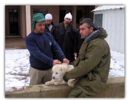
Door-to-door rabies vaccination by an Israeli Veterinary Services officer in a village, January 2010.

The Veterinary Authorities in Israel are alarmed about the sharp rise in the number of rabies cases among animals – 58 cases in 2009 and already 4 have been confirmed in January 2010. 74% of these cases were recorded in dogs (n=36) and