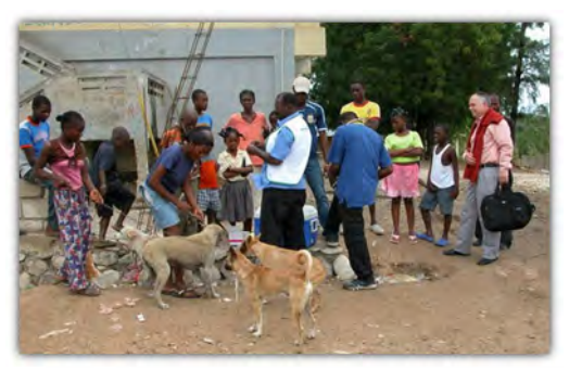
Vaccination in Haiti in 2007

Recently, everybody listened to news of the terrible earthquake that killed around two hundred thousands people in Haiti. This tragedy followed two major hurricanes in 2008, and decades of social crises and very high rates of poverty. However, it must also be said that in the midst of so many obstacles, Haiti has demonstrated strong will and perseverance in fighting against its challenges, including rabies.