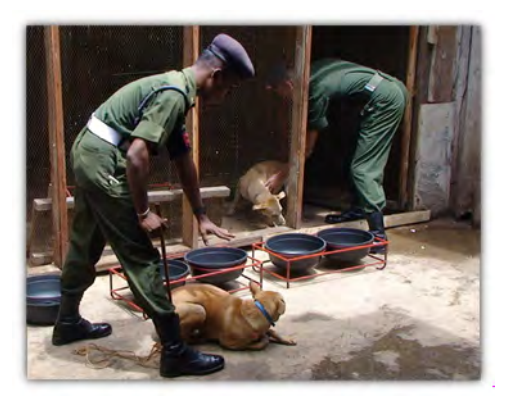
A designated feeding station with bowls designed not to tip over

The Trust uses dog sterilization and vaccination, capacity building of relevant personnel, and infrastructure and educational campaigns focused on changing attitudes, increasing awareness and building the collective responsibility of communities. Our focus is to achieve sustainable impact through scientific and systematic interventions which equally balance the needs of human and animal welfare.