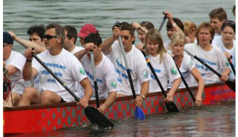
racers at a city festival in Wusterhausen, Germany.

their Veterinary colleagues to provide simultaneous human health and veterinary care at their World Rabies Day event.