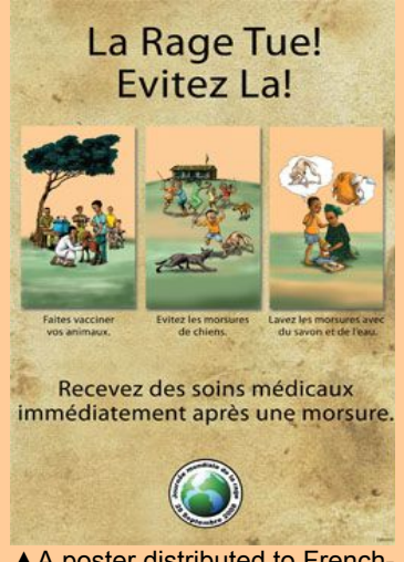
▲ A poster distributed to Frenchspeaking African Countries

welfare to people passing by the centre ▼ WORLD RABIES DAY