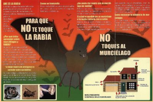
Leaflet on preventing bat rabies distributed in Chile

Here are just a small selection of the enormous range of educational materials distributed to mark WRD 2008. A full listing of event details and participating organizations will be available shortly at www.worldrabiesday.org